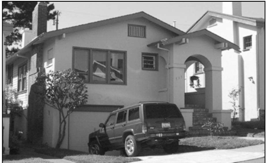
5% of the estate of this Westwood Park Home was left to the Association in 2002.